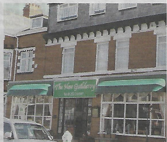
The New Guilderoy in North Shore

"I like to think we go the extra mile for our customers, so we are very pleased to see we made the top 10."